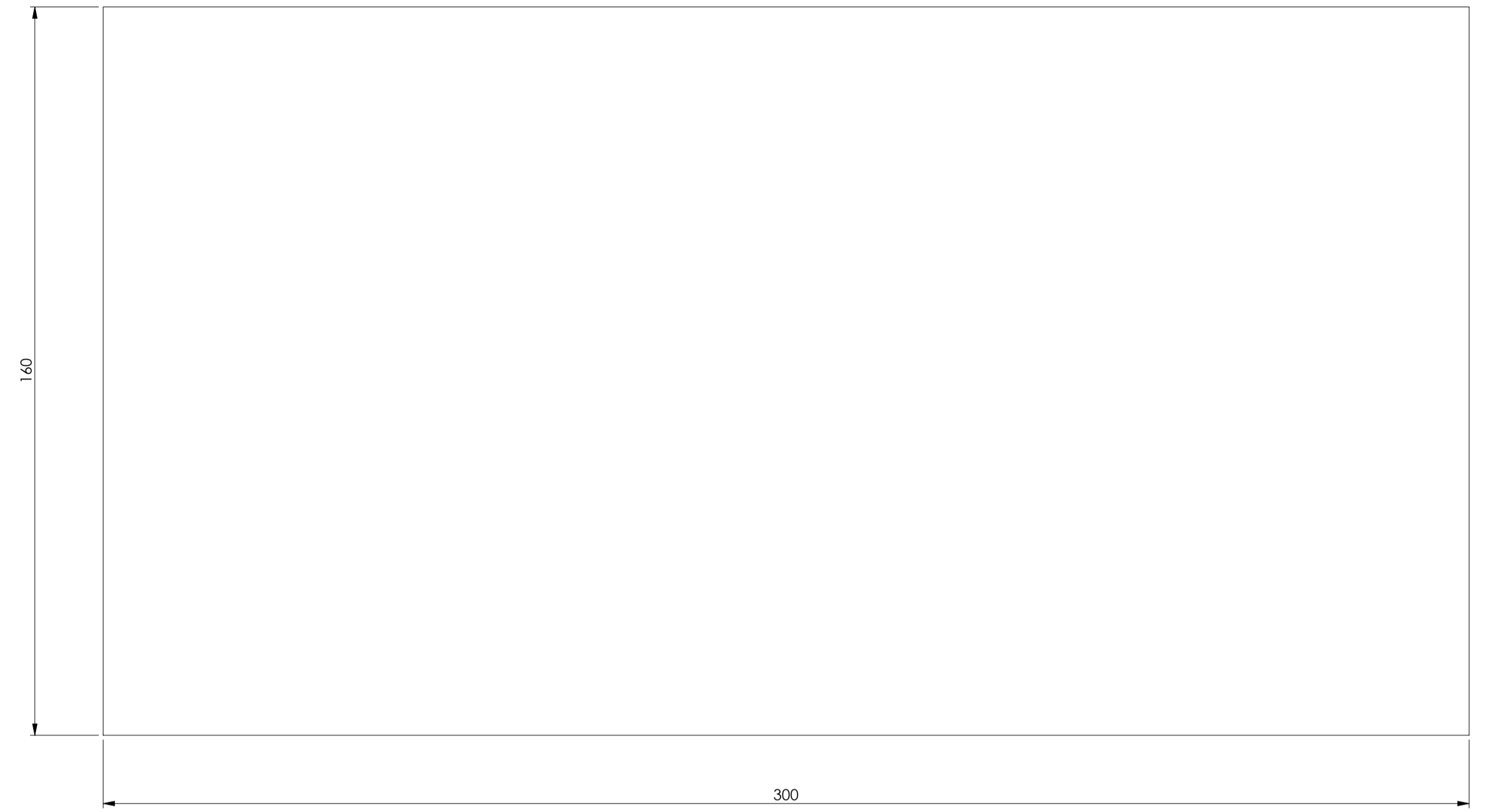
MAX PCB SIZE